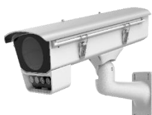
1331HZ-B Outdoor Housing + DS-2202ZJ Integrated Mount