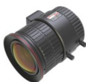
HV3816P-8MPIR 3.8 to 16 mm P-iris