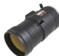
HV1140P-8MPIR 11 to 40 mm P-Iris