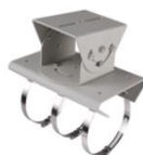
DS-1214ZJ Horizontal Pole Mount