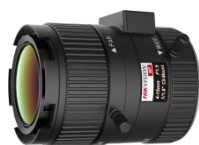
HV0415D-4MP 4 to 15 mm DC Iris