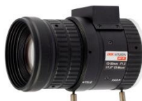
HV1250D-4MPIR 12 to 50 mm DC Iris