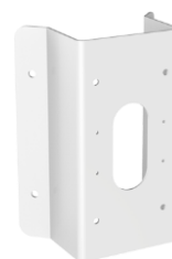
DS-1476ZJ-SUS Corner Mount