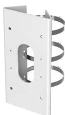
DS-1475ZJ-SUS Vertical Pole Mount